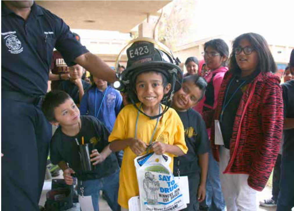
Gila River firefighters let students at the Casa Blanca Community School Career Day Apri 24 practice wearing bulky firefighter gear.