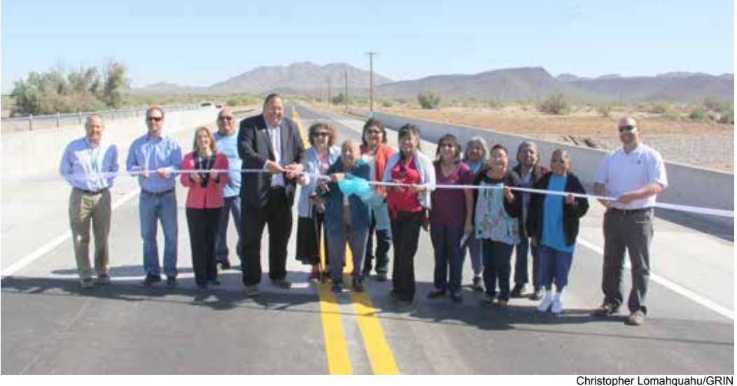
Tribal leaders and Community elders met with GRICDOT, FHWA and construction workers to cut the ribbon on the new Sacaton bridge, which opened April 16.

The pace of construction was quick according to project coordinators, to accommodate the high flow of traffic that travels