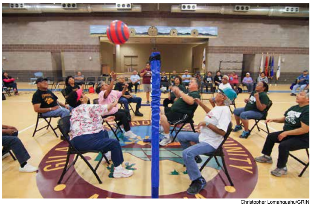
The home team from District 5, the Mustangs (right), won the chair volleyball tournament at the annual Elder Spring Picnic April 17 at the Vah-Ki Multipurpose Building.