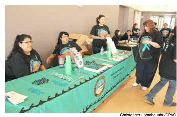
committed. It is a very tragic the Sexual Assault Gathering April 18.