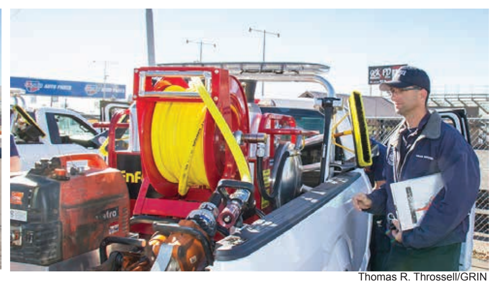
Kraig Broadbent inspects vehicles to make sure they are ready for racing events.