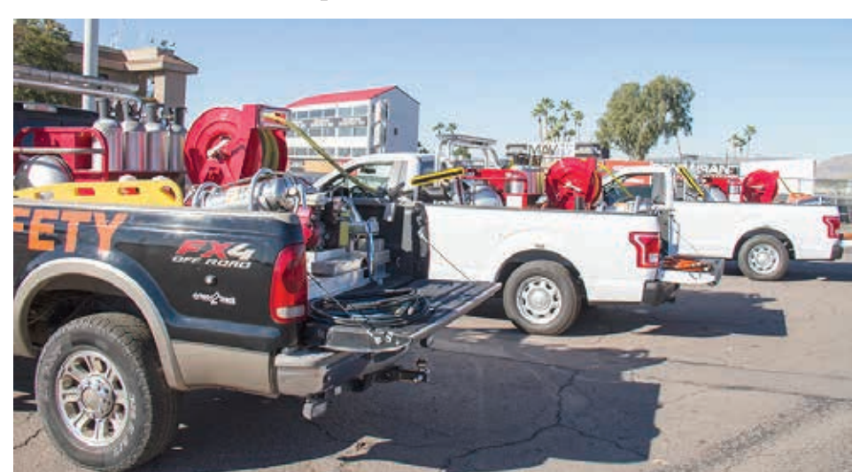
WHPMP safety trucks