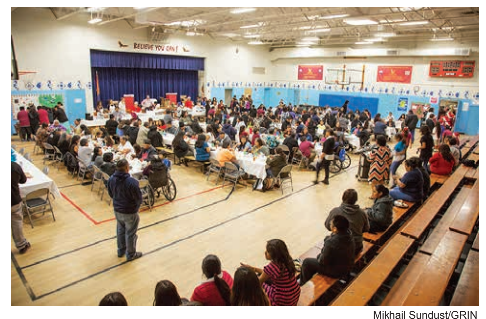
Families packed the school cafeteria for some holiday fun at GCCS.