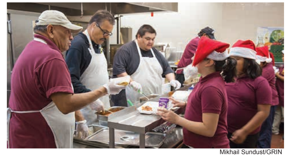
Gila Crossing Community School hosted a Christmas dinner with their families on Dec. 22.