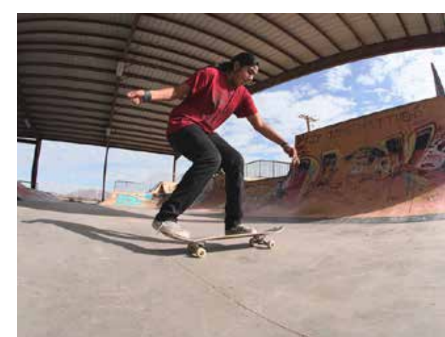
Skaters received prizes and promotional items for competing in the skate competition.