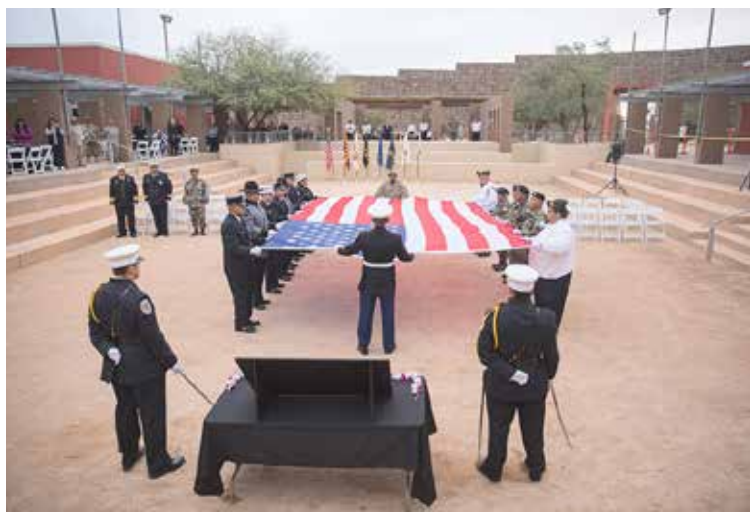
U.S. flag flown over the USS Arizona is unfolded at the Huhugam Heritage Center on Dec. 6.