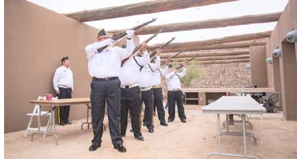
Ira H. Hayes American Legion Post 84 performs a salute at the Huhugam Heritage Center.

"This is hallowed ground here and I hope that each of us think about what connection they have to this flag, because it just shows that we never forget those sacrifices made