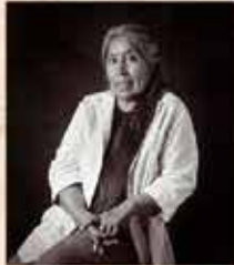
Ofelia Zepeda Renowned Native American poet and linguist (Tohono O'odham)