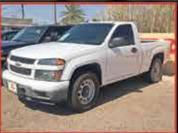
2012 Chevy Colorado