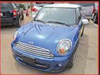
2013 Mini Cooper