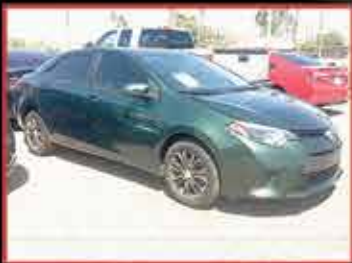
2015 Toyota Corolla