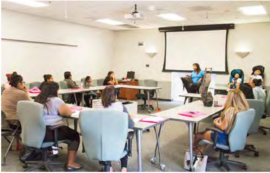
Thomas R. Throssell/GRIN

The training program was filled with mothers wanting to learn more about how to better keep their children safe through proper car seat installation.