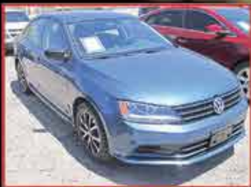
2016 Volkswagen Jetta