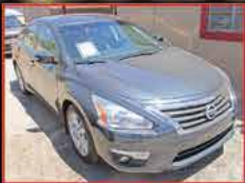
2013 Nissan Altima