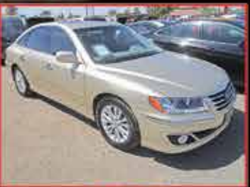
2011 Hyundai Azera