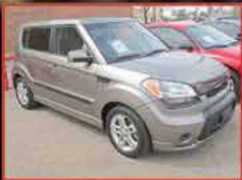
2011 Kia Soul