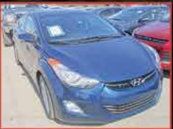
2013 Hyundai Elantra