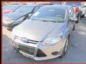
2014 Ford Focus (3 available)