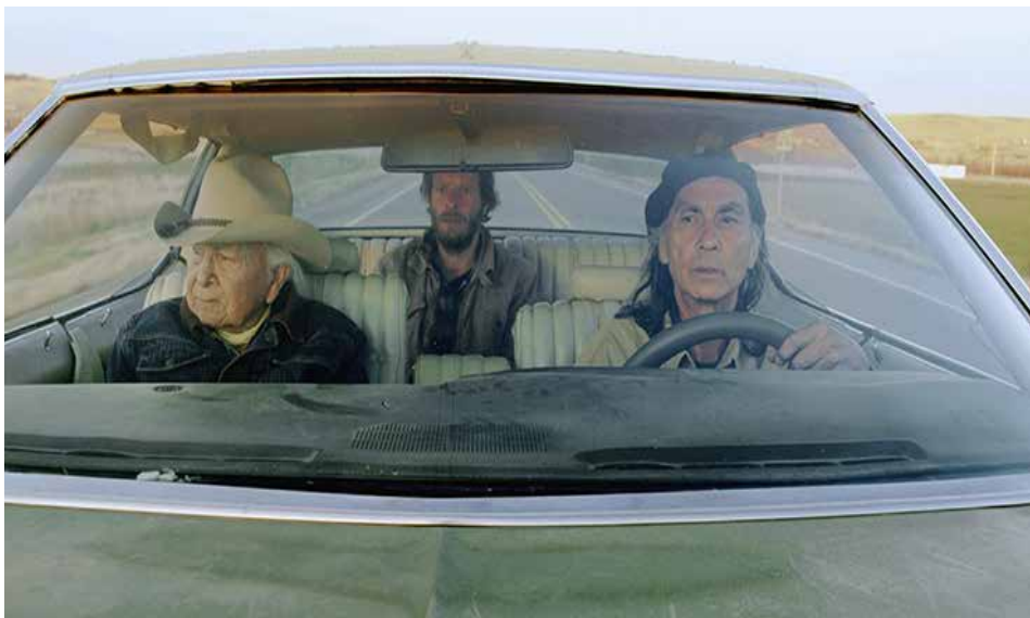
“Neither Wolf, Nor Dog” follows a writer’s journey through the Pine Ridge Reservation.