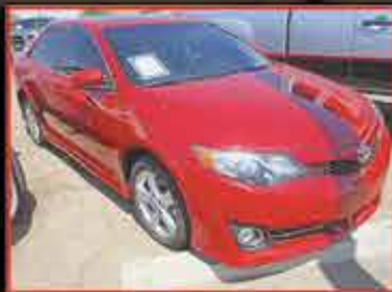
2012 Toyota Camry