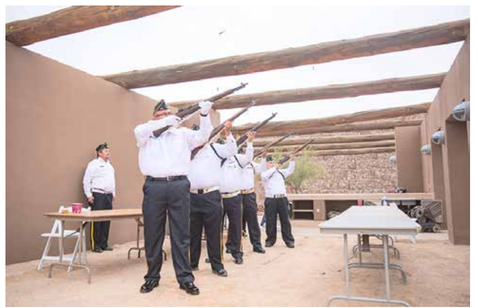
Ira H. Hayes American Legion Post 84 performs a salute at the Huhugam Heritage Center.

“This is hallowed ground here and I hope that each of us think about what connection they have to this flag, because it just shows that we never forget those sacrifices made