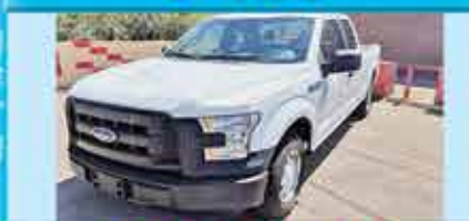
2015 Ford F-150