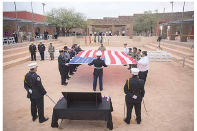
U.S. flag flown over the USS Arizona is unfolded at the Huhugam Heritage Center on Dec. 6.