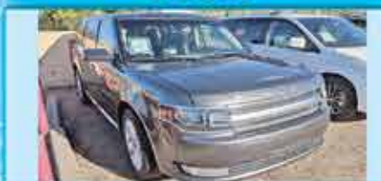
2017 Ford Flex