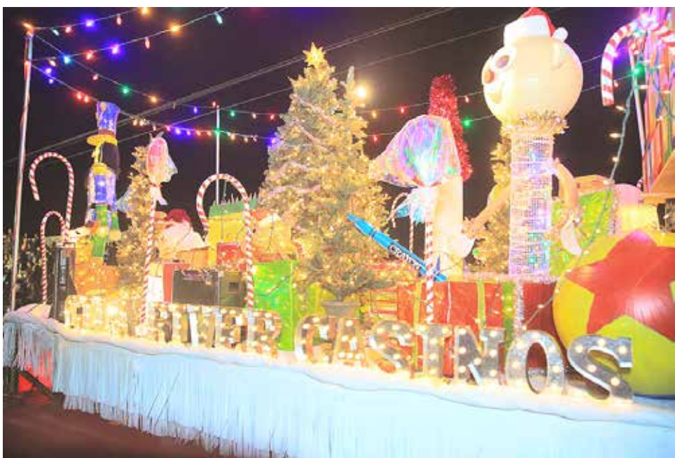
Christmas themed floats rode down Casa Blanca for the River of Lights.