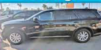
2015 Dodge Durango