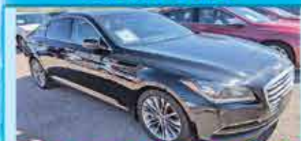
2015 Hyundai Genesis