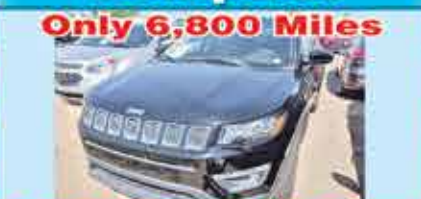
2017 Jeep Compass