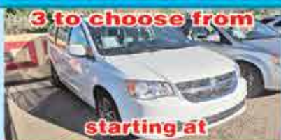
2017 Dodge Grand Caravan