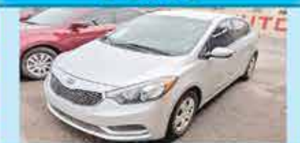
2016 Kia Forte