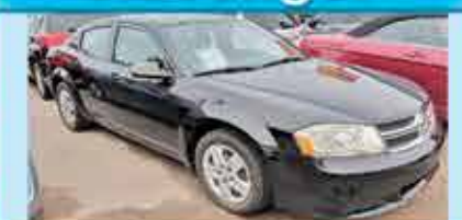
2014 Dodge Advenger