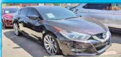
2016 Nissan Maxima