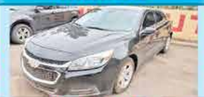
2015 Chevy Malibu