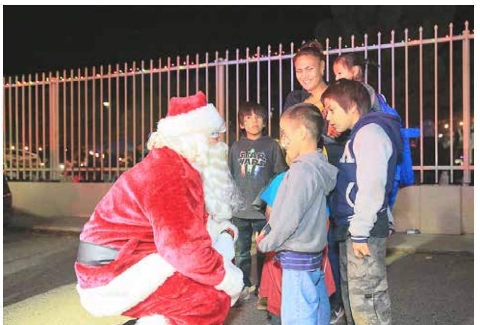
Santa Claus visits the with local children ahead of the Christmas holiday.

Gila River Indian News P.O. Box 459 Sacaton, AZ 85147 Change Service Requested