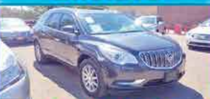
2017 Buick Enclave