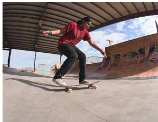
Skaters received prizes and promotional items for competing in the skate competition.