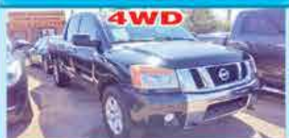
2014 Nissan Titan