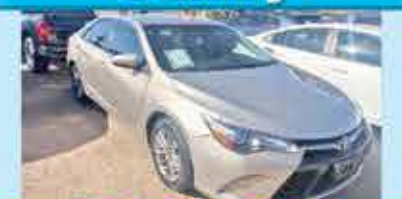
2017 Toyota Camry