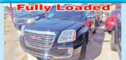
2016 GMC Terrain AWD