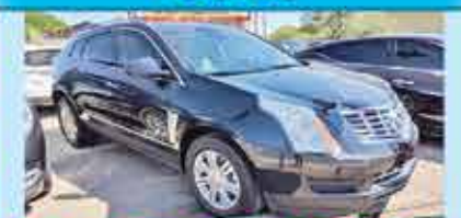
2015 Cadillac SRX