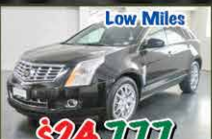
$24,111 2015 Cadillac SRX