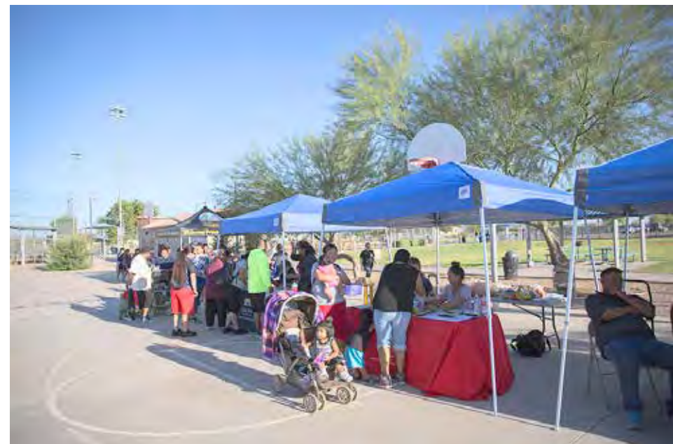
Booths lined the basketball court for screenings and checkups.

Programs, that helped put on the community wellness night were the Communications & Public Affairs Office, Tribal Health Department, Genesis Diabetes Prevention for Children, Akimel O'odham/Pee-Posh Youth Council, Wellness Center, Life Center and District. 4.