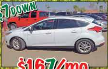
$167/mo. 2015 Ford Focus