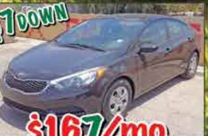
$167/mo. 2015 Kia Forte