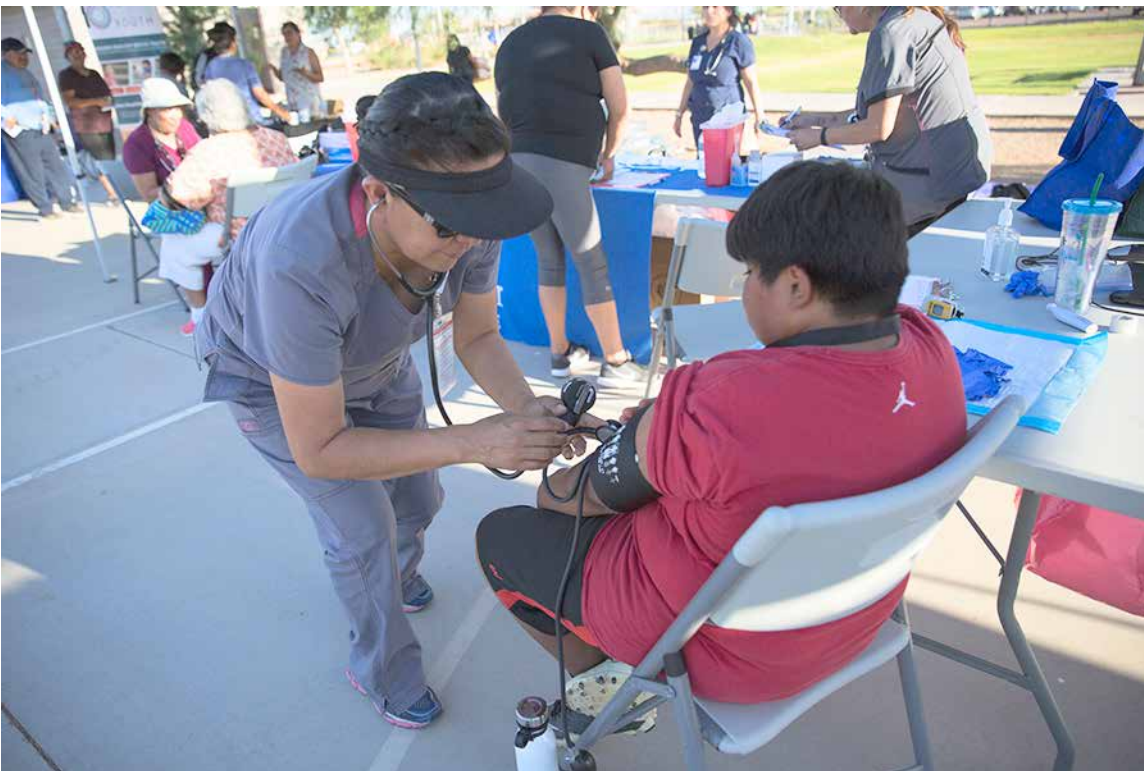
Health workers give check-ups at the 7th Annual Community Wellness Night in District 4.

Increasing in size from last year, the community wellness night was a hit, drawing in 290 participants and 160 individuals, who laced-up their running shoes