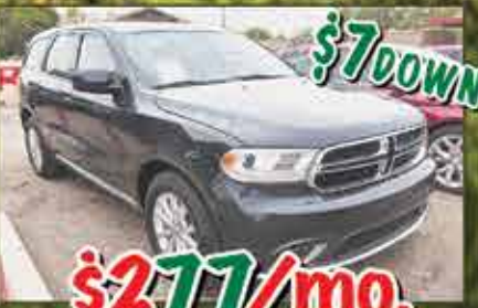
$277/mo. 2014 Dodge Durango