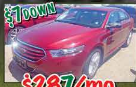
$287/mo. 2016 Ford Taurus