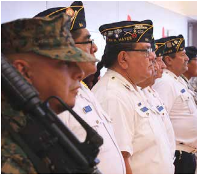
Veterans stand during the O'otham Veterans Celebration in District 2 on Sept. 15.