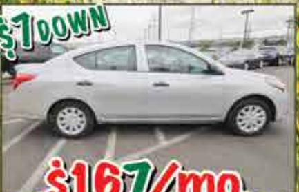
$167/mo. 2015 Nissan Versa

No Credit Bad Credit Repossession Bankruptcy Divorce Foreclosure