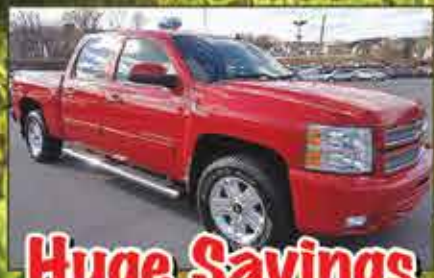
Huge Savings 2013 Chevy 1500 4x4