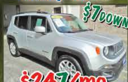
$247/mo. 2016 Jeep Renegade