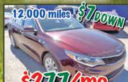
$277/mo. 2018 Kia Optima