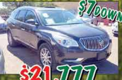
$21,111 2017 Buick Enclave