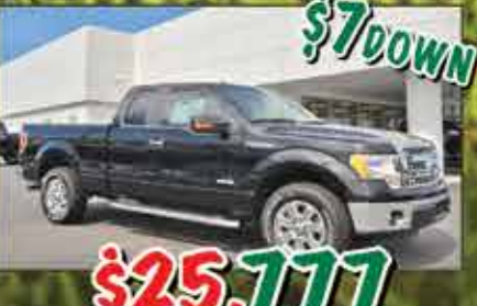
$25,111 2014 Ford F-150