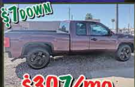
$307/mo. 2013 Chevy 1500