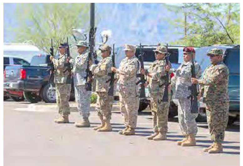
Veterans attend the 153rd Annual Mustering-In Day celebration.