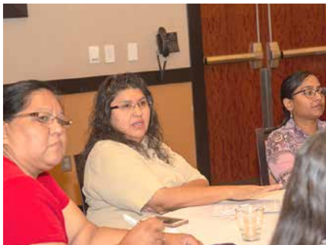
Managers from different Community departments learn about the new hiring process during a meeting.

ger transit bus that is equipped with a ramp for easy access and uses a kneeling feature that lowers the front of the bus closer to the ground at the bus entry/exit door.