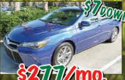
$277/mo. 2015 Toyota Camry