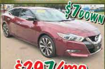
$297/mo. 2016 Nissan Maxima