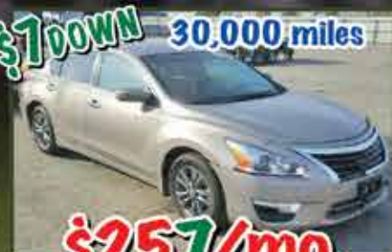
$257/mo. 2015 Nissan Altima