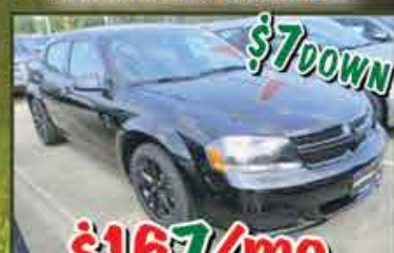
$167/mo. 2014 Dodge Avenger