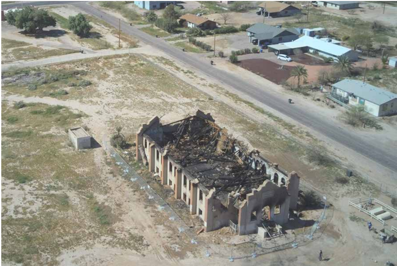
An aerial view of the C.H. Cook Memorial Church shows the extent of the fire damage.