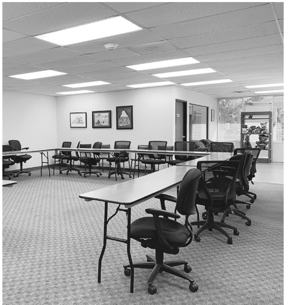
The Native American Fatherhood & Families Association received a grant from GRIC to train facilitators.

For more information about the workshops and train-the-trainer sessions, you can contact NAFFA at (480) 833-5007. NAFFA also hosts on-going drop-in groups every Tuesday and Wednesday at 1:00 p.m. to 3 p.m.