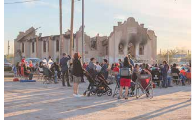
The March 29 vigil included relatives of the late Charles Cook.