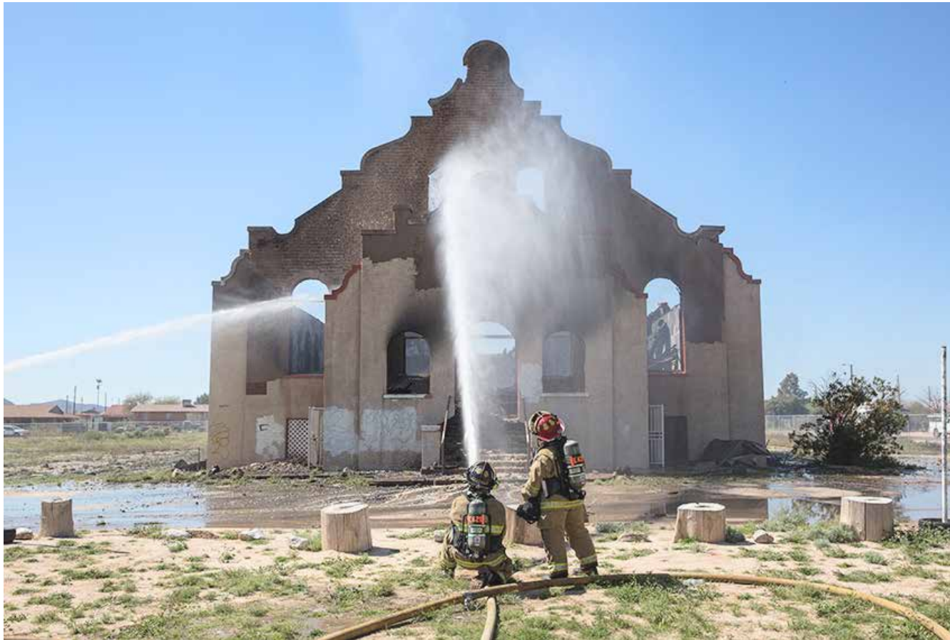
Crews put out the fire at the historic Presbyterian Church in Sacaton on March 25.