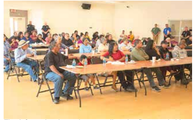
The informational meeting regarding the fire was held on March 30.