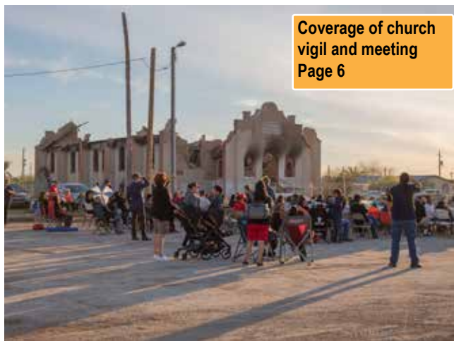
Crowds gather outside the church for a vigil.

After an investigation, GRPD officers located three suspects who were taken into custody for arson. On March 26, the Gila River Fire Department thanked the following parties on their Facebook page for assisting with the emergency: Gila River Health Care, Gila River Department of Public Works, Gila River Office of Emergency Management, Gila River District 3, Casa Grande Fire Department, Chandler Fire Department, AZ Fire Medical - Battalion 231, Alcohol Tobacco and Firearms (ATF).