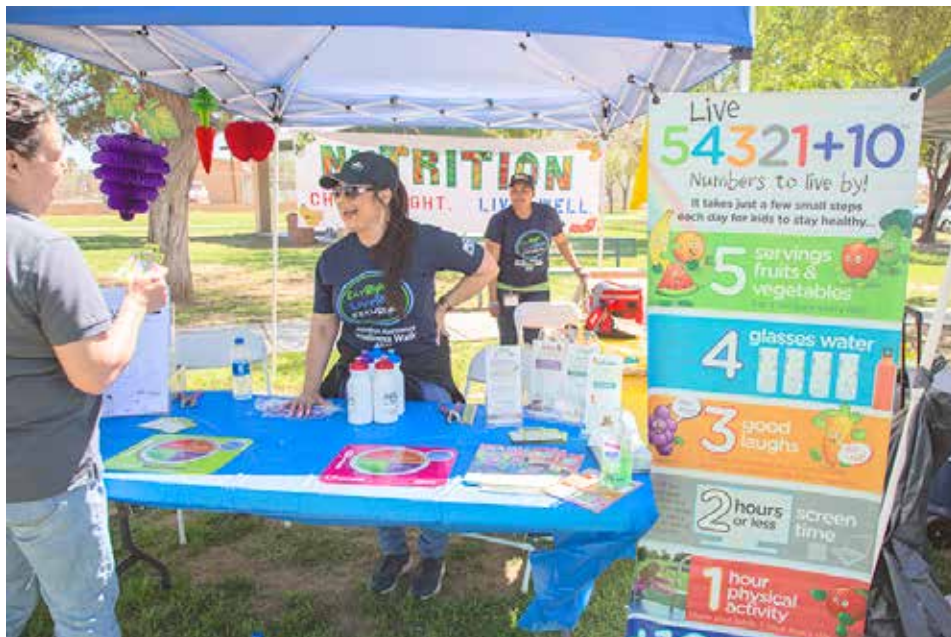
Attendees visited several booths at the fair for information and other items.