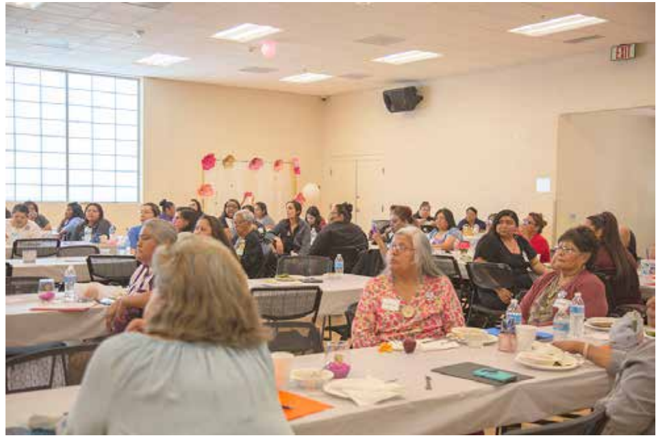
About 60 women attended and listened to the panelists on March 23.