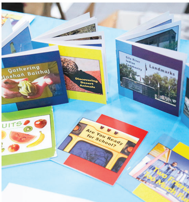
The Growing Readers & Developing Leaders provides reading material for families pertaining to culture and learning.

Fourth goal: "establish a cross-sector, professional learning community that build the capacity of schools and existing community organizations to overcome the barriers of book scarcity to close the achievement gap." Professional development