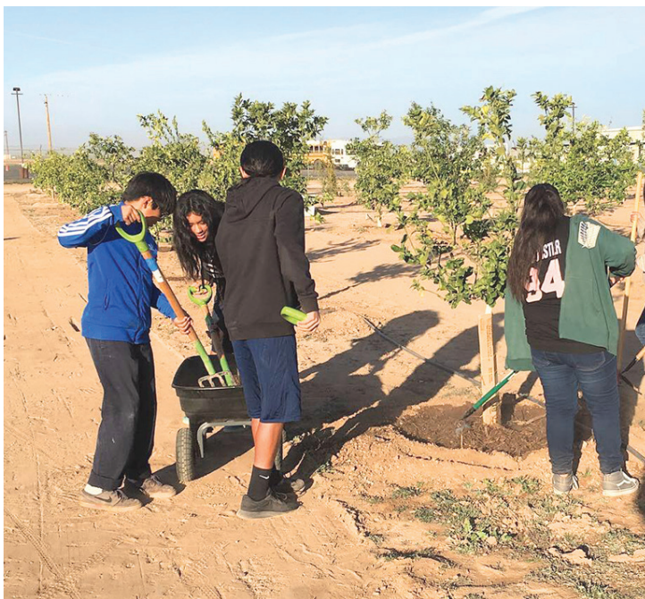
Students work in the orchard, which helped the school win the "Solve for Tomorrow" contest.