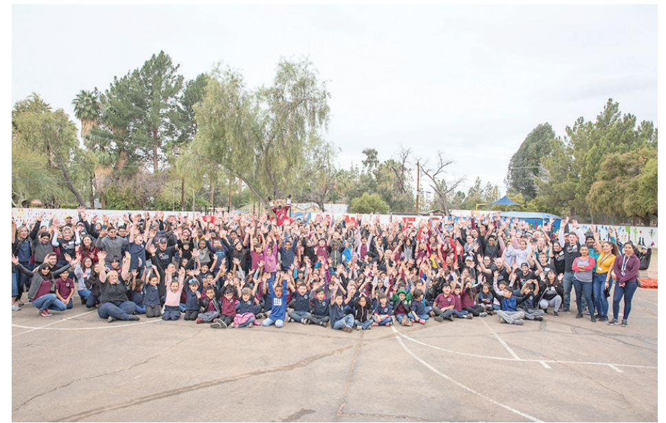
The volunteers gather with students at the Phoenix New World Education Center.