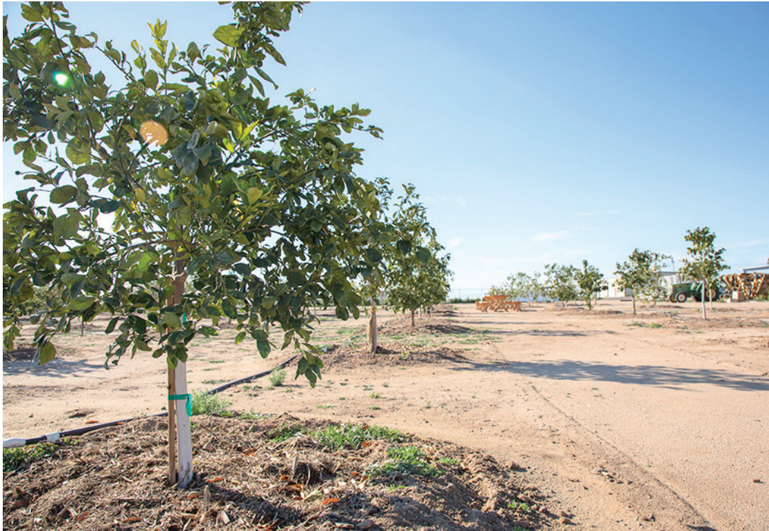
The Legacy Orchard, located at Sacaton Middle School, contains 144 citrus trees.