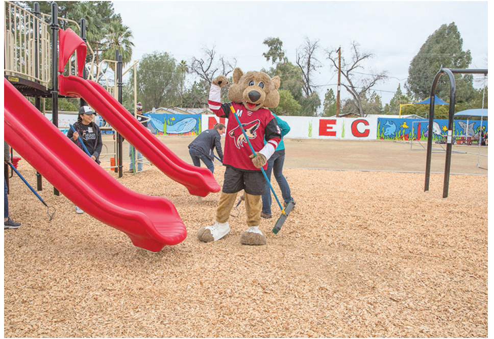
Arizona Coyotes' mascot, Howler, lends a helping hand.

gathered in front of the playground to belt one big howl along with the Arizona Coyotes mascot Howler.