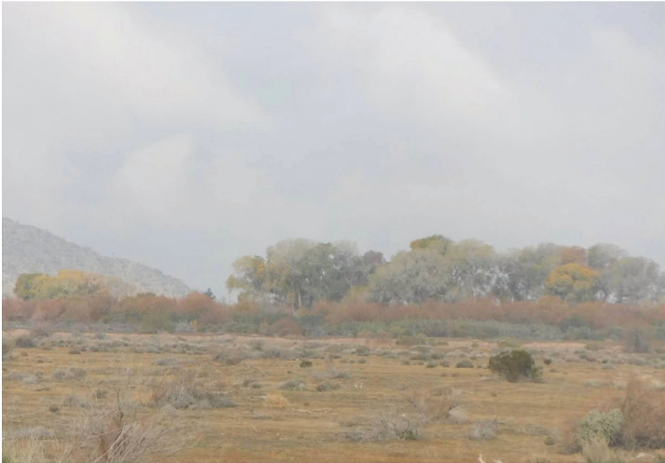
Nui kosh D-4

The name for this month refers to the budding of the Auppa (Fremont's Cottonwood) later this month. This occurrence reminds O'otham that spring is a few months away. Many O'otham have been talking about the weather lately, it seems as we had just experienced another ju:k (rain) system as it had passed through our community. We have ex-