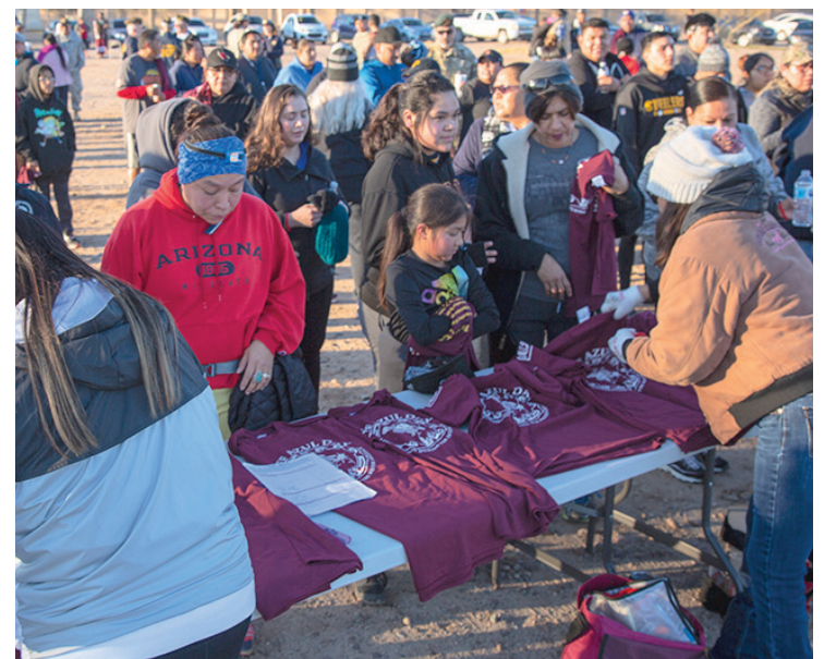
The celebration began with a 1-mile walk/5k run.