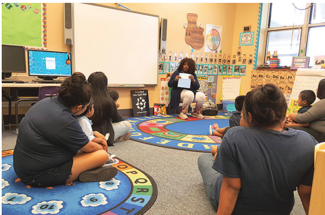
The Growing Readers & Developing Leaders program assist with literacy in the home.