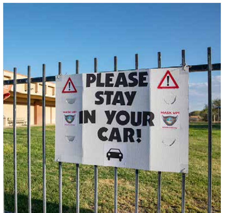
Casa Blanca Community School held a "Technology Distribution" from August 10-14 for students to attend school through virtual classes or distance learning for students.

Casa Blanca began virtual learning on August 3rd for stu-