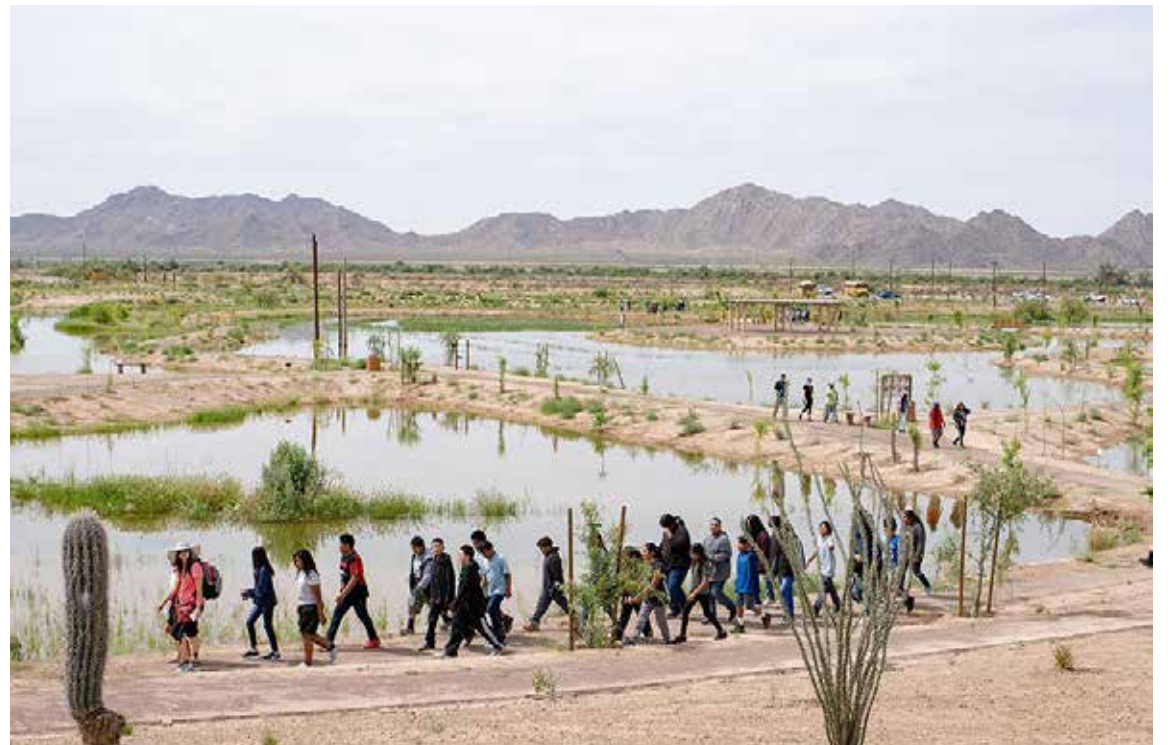
Photograph of MAR-5 featured by Parade Magazine.

You can find the original article by visiting parade.com/1022304/kmccleary/earth-day-activities/.