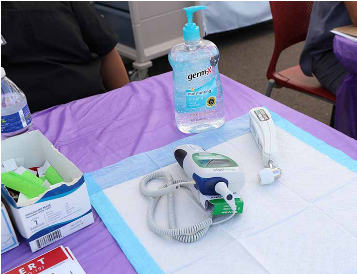
Gila River Health Care screening stations.

Christopher Lomahquahu Gila River Indian News