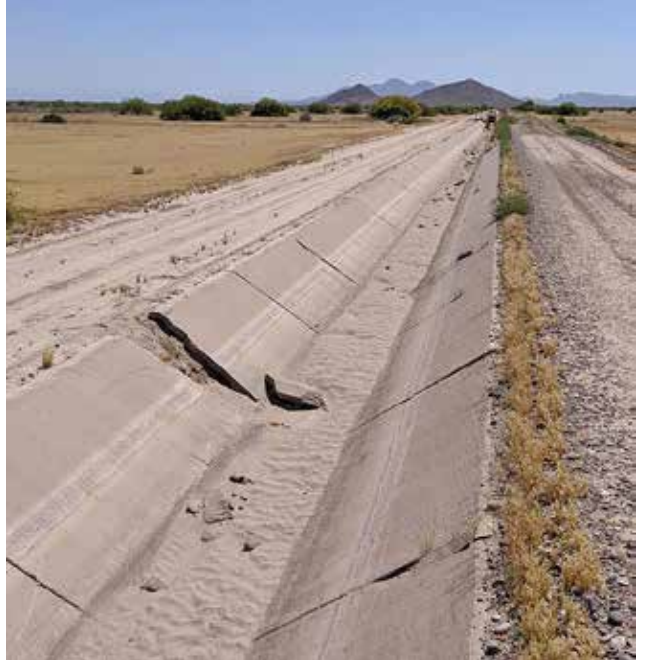
Canal 13-5.6 upstream of Vahki Road. This too will be replaced with a 2' bottom concrete-lined ditch.