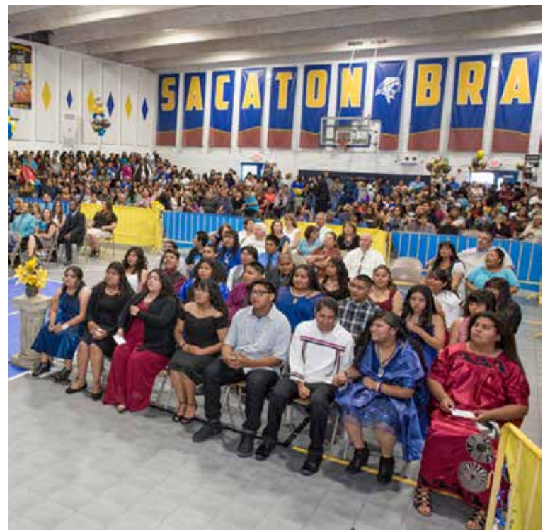
Sacaton Middle School eighth grade promotion from 2018.

walking across the stage may be on hold. Still, inevitably, schools and families will find a way to recognize their students.