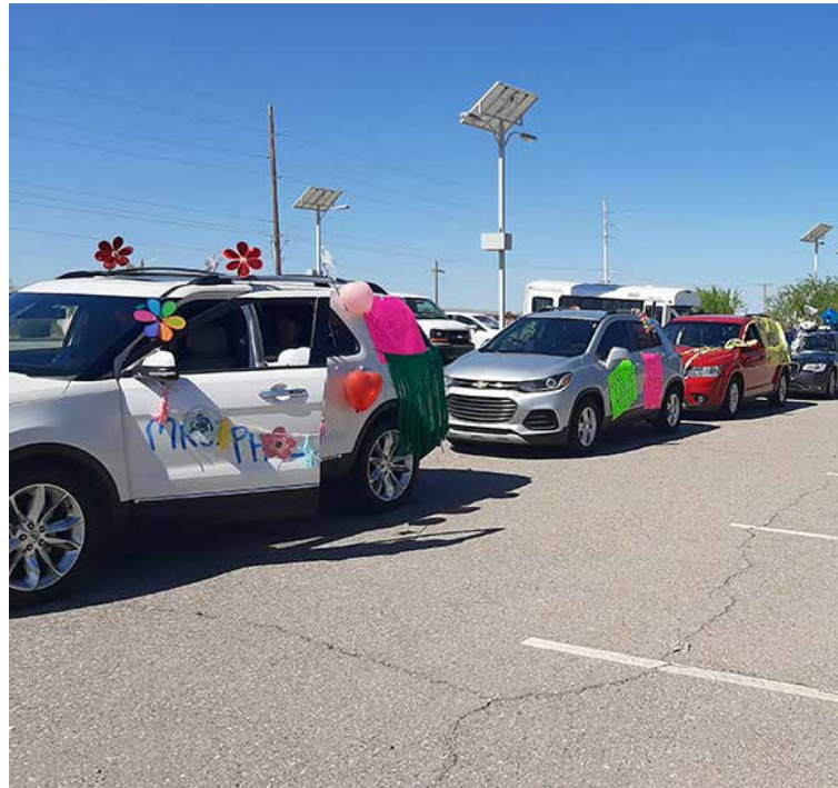
Cars line up for the parade.

much they miss their students and hope to see them back in the classroom soon.