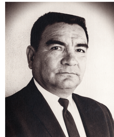
Jay R. Morago Jr. is considered the first Governor under the 1960 Constitution.

Santan established their own Constitution in 1901. A group of approximately 50 met and ap-