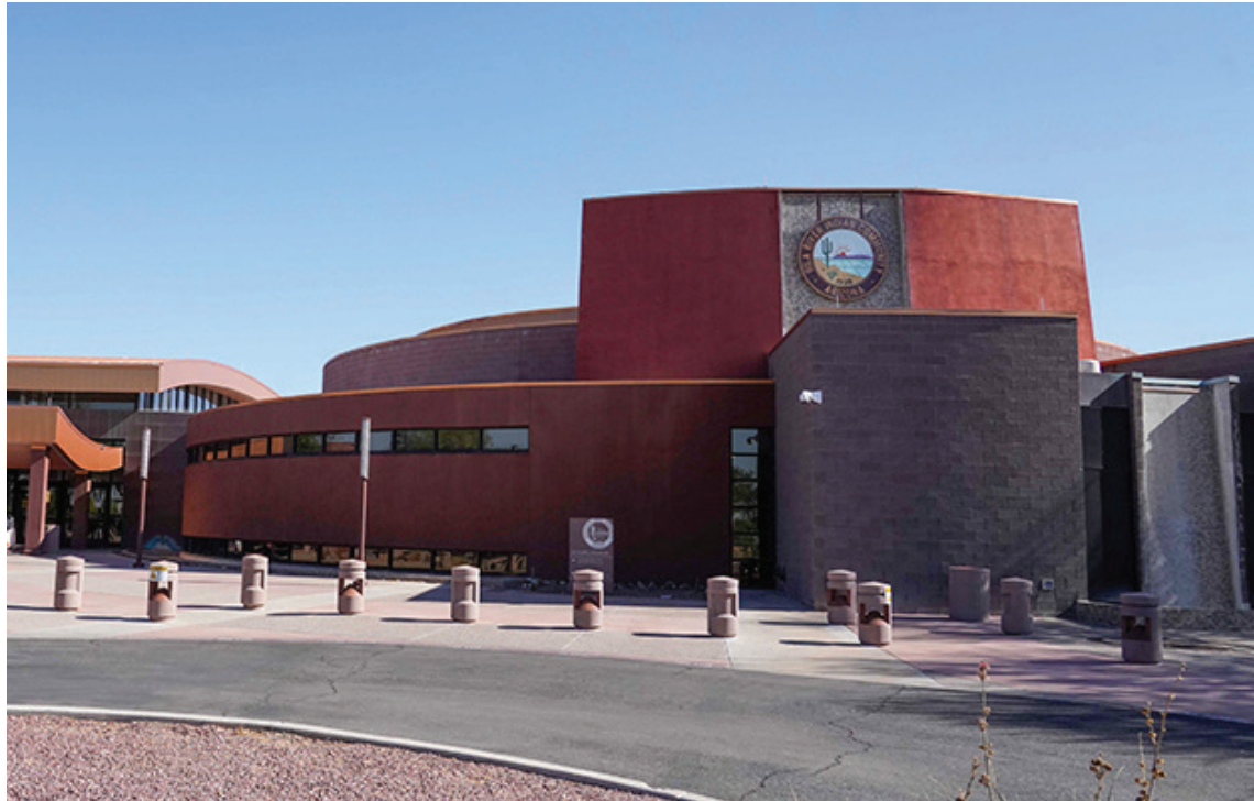
The Gila River Indian Community Governance Center located in Sacaton, Ariz., District 3. On Nov. 3, the Community is holding a Special Election on amendments to the constitution in conjunction with the General Election.