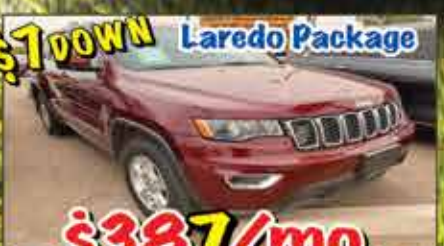
$387/mo. 2017 Jeep Grand Cherokee