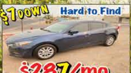
$287/mo. 2018 Mazda 3

No Credit Bad Credit Repossession Bankruptcy Divorce Foreclosure