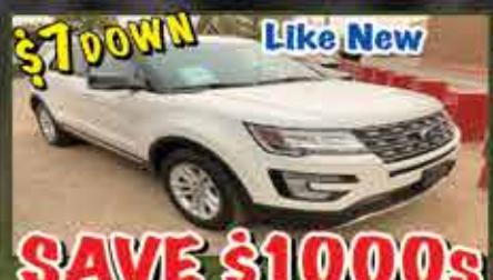
SAVE $1000s 2017 Ford Explorer