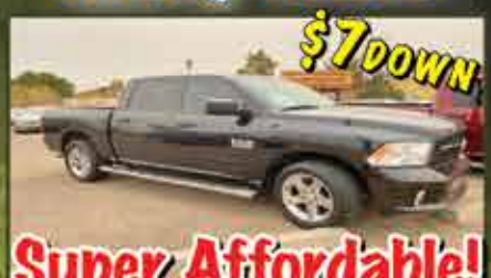
Super Affordable! 2017 Ram 1500