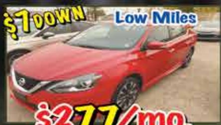
$277/mo. 2019 Nissan Sentra