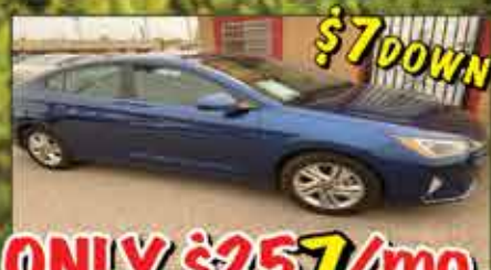
ONLY $257/mo. 2020 Hyundai Elantra