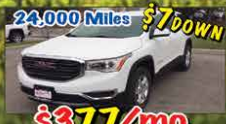
$377/mo. 2017 GMC Acadia