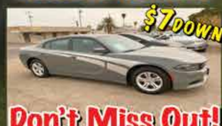
Don't Miss Out! 2019 Dodge Charger