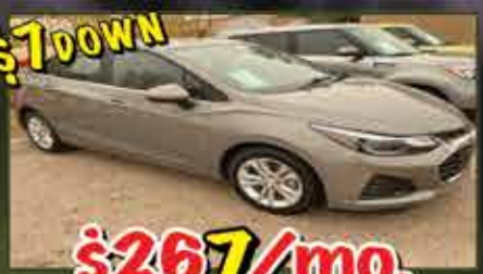
$267/mo. 2019 Chevy Cruze