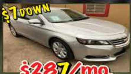
$287/mo. 2018 Chevy Impala