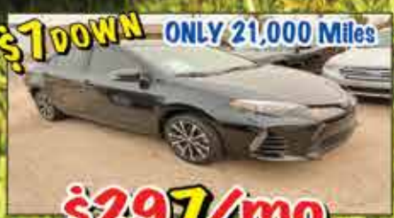
$297/mo. 2017 Toyota Corolla SE