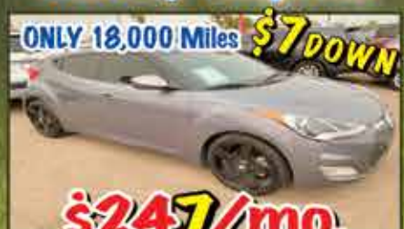
$247/mo. 2017 Hyundai Veloster