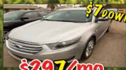
$297/mo. 2018 Ford Taurus Limited