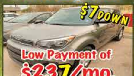
Low Payment of $237/mo. 2018 Kia Soul