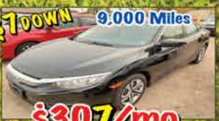
$307/mo. 2018 Honda Civic