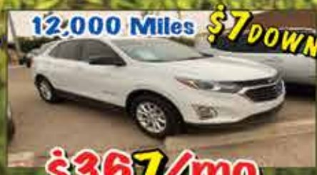
$367/mo. 2019 Chevy Equinox