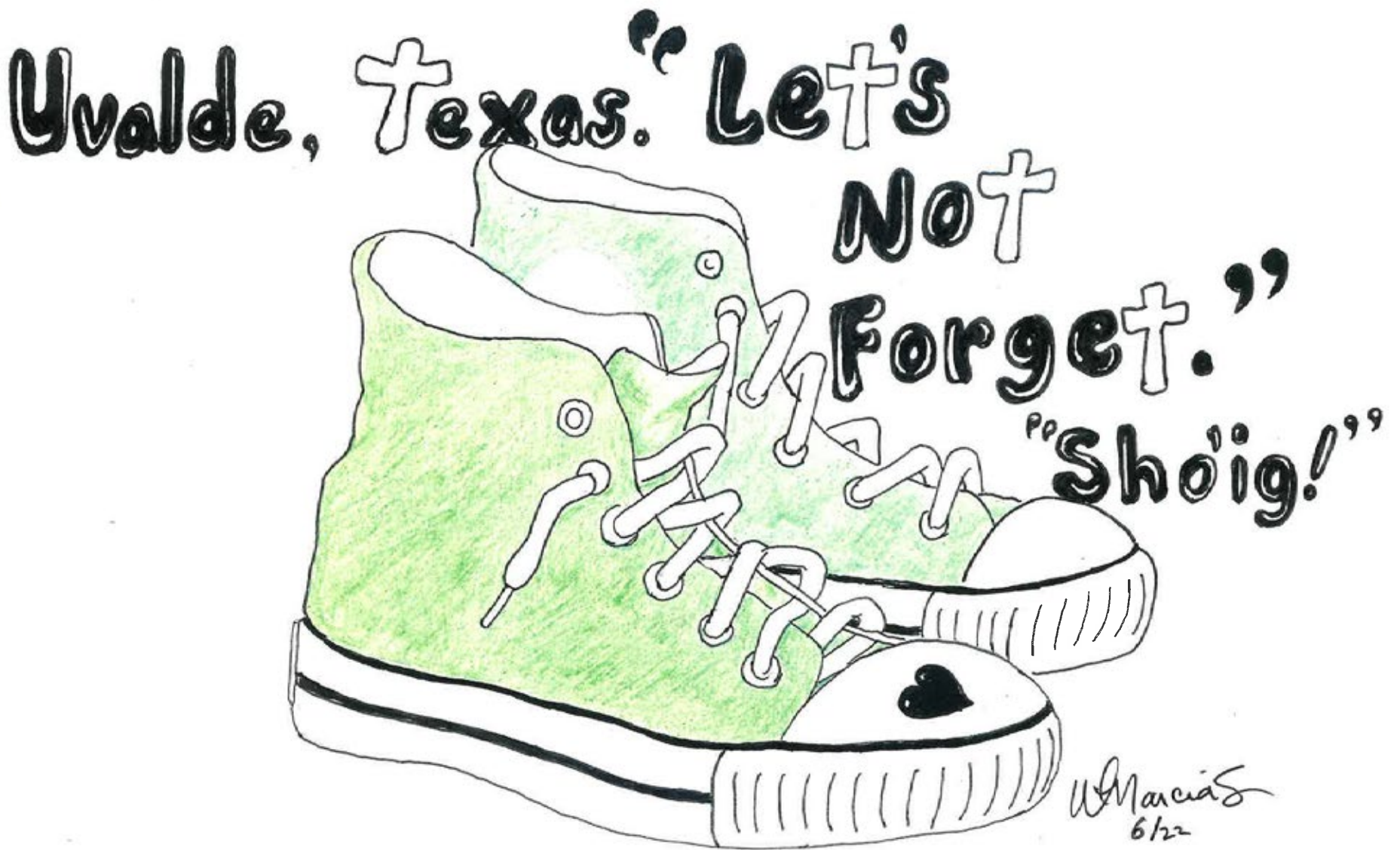
Sho'ig - an apology, Suffering, poverty - (Pima)