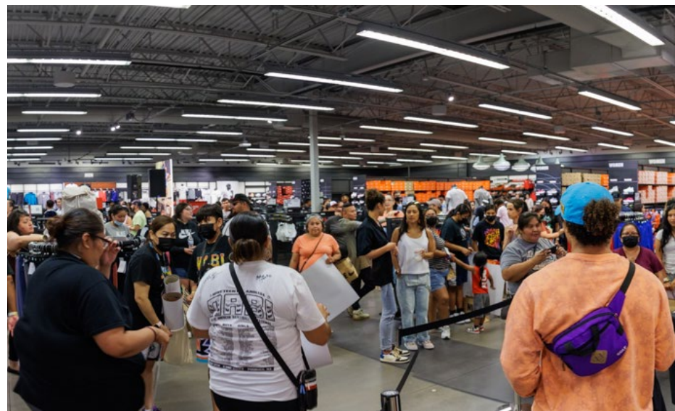
Dozens of NABI athletes gathered at the Nike Factory Outlet for the NABI and Nike N7 event for photos, autographs, and prizes.