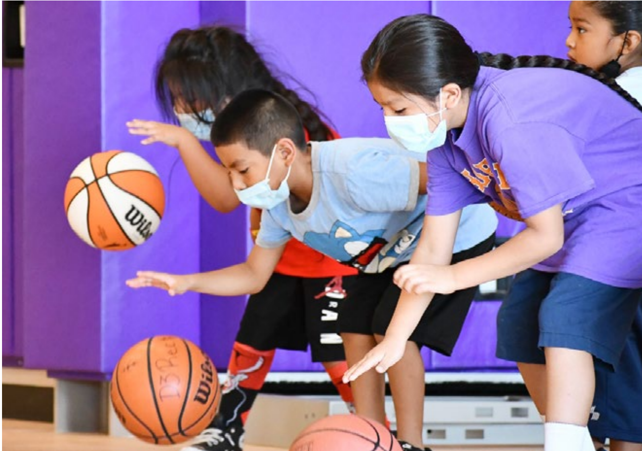
Youth participants practice dribbling and ball handling skills movements at the July 23 Basketball Clinic in District 3.