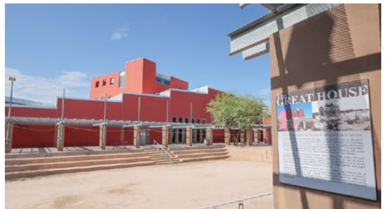
Exterior of the Huhugam Heritage Center’s courtyard outside of the new exhibit space.