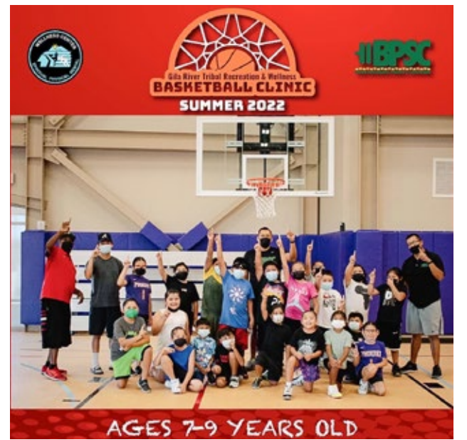
Top Photo: Basketball Clinic participants 5-6 years old, bottom photo: Basketball Clinic participants 7-9 years old.