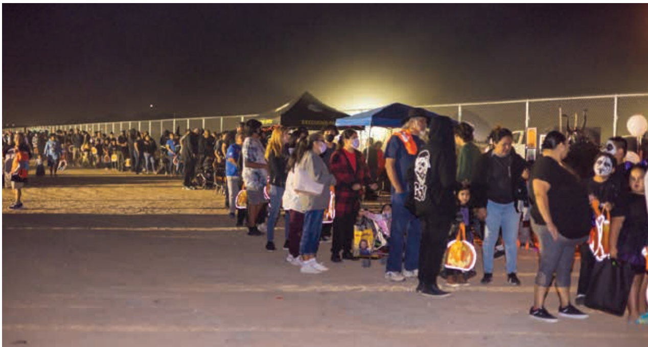
Hundreds of family members waiting to get in the trunk-or-treat area for candy and games provided by GRIC departments and program staff.