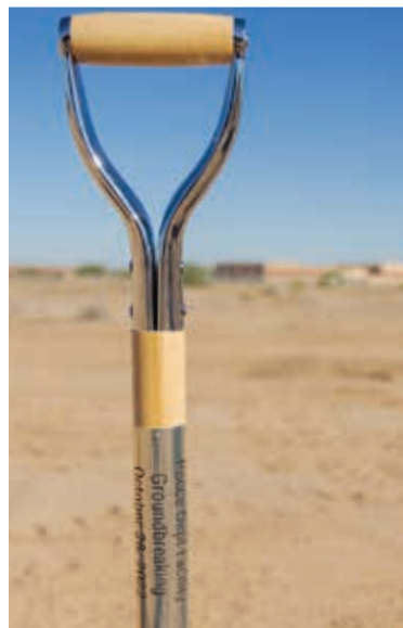
A commemorative shovel was created for the Oct. 28 ground breaking ceremony.