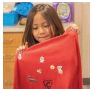
Boys made their own capes during the Super Hero party on Oct. 15.

TED hopes to continue similar events throughout the Community in the future.