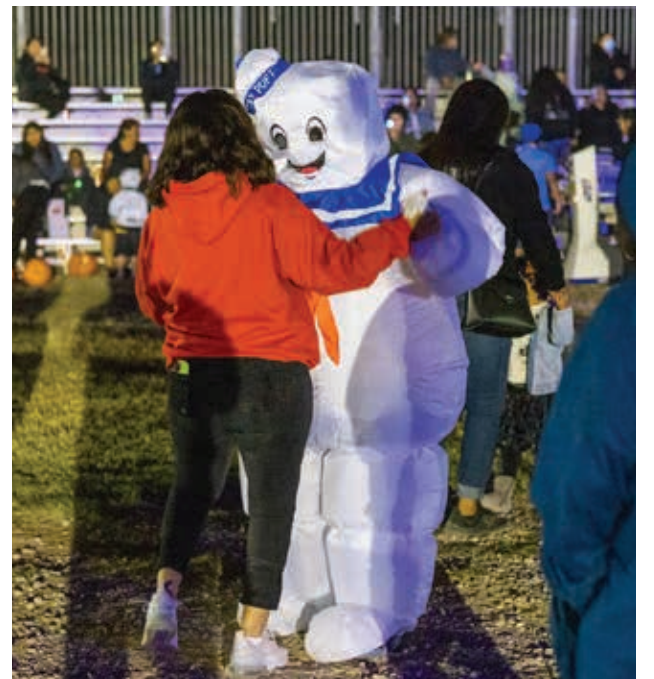
Attendees enjoyed dancing to music performed by Gertie 'n' the T.O. Boyz.