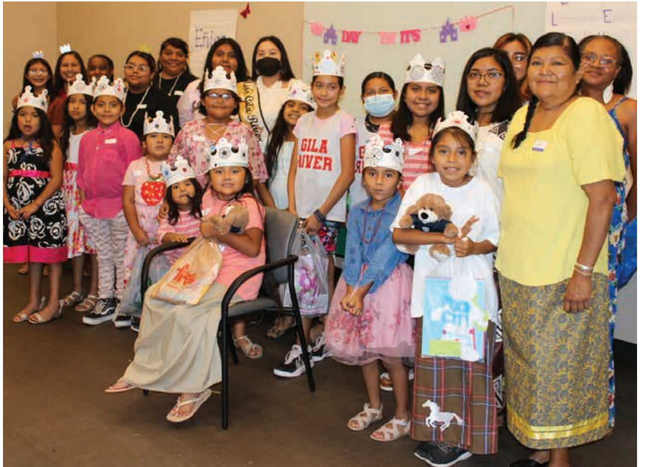
Participants, AOPPYC volunteers, and TED staff with crowns made during the Pretty in Pink event in District 3 on Oct. 8.