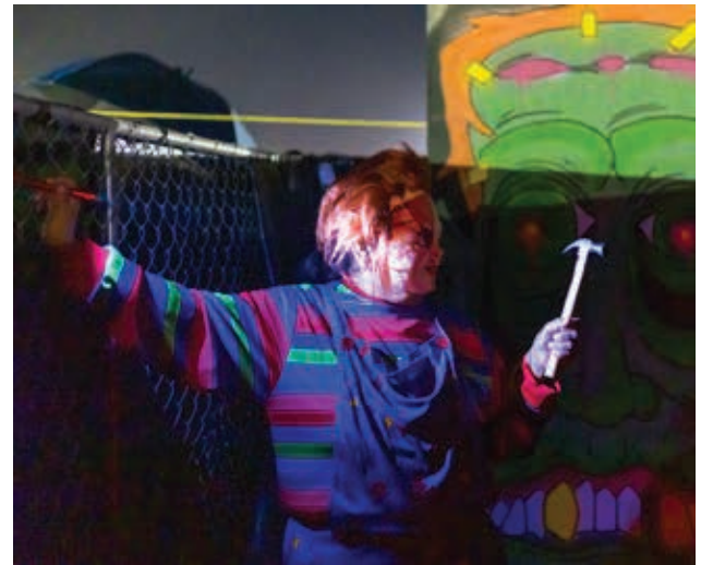
A volunteer at the Trail of Doom haunted maze ready to serve up some scares.

And no Halloween themed event is complete without some candy. A portion of the fairgrounds designated for families to trunk-or-treat featured 32 GRIC programs and departments with booths to distribute candy to all in attendance. Closing out afterward, Orque shared, "The event was made possible by Tribal Recreation and Wellness staff, District 7 staff, District 3 staff, trunk-or-treat booths, and volunteers."