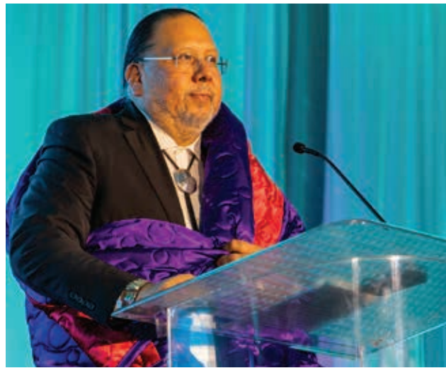
Gov. Lewis provides his acceptance remarks with a blanket gifted to him from the Phoenix Indian Center.

family’s public service and accomplishments to instilling those qualities in him.