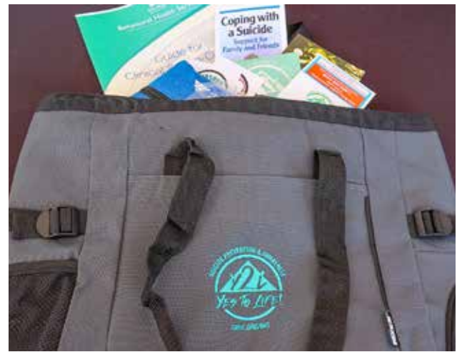
Anyone that stopped by the drive-thru event held on Sept. 13 received a bag with informational items on suicide prevention and awareness.

Teen Lifeline (state-wide): 1-800-248-8336