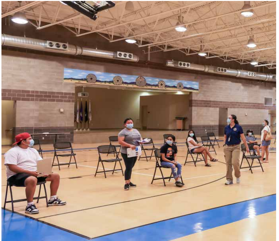
A photo at one of the first youth vaccination events held in District 5 when vaccinations for youth became available starting in the spring.

COVID-19 vaccinations are still the most effective protection against COVID-19-related illness and hospitalization. Currently, 70% of the community's residents are Not Up to Date on their COVID-19 vaccinations. Please visit Gila River Health Care or GRHC.org/hub for more information to schedule a vaccination or vaccine booster.