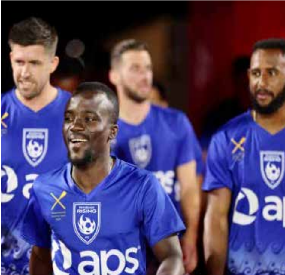
Members of Phoenix Rising take to the field wearing special warm-up jerseys recognizing Indigenous Peoples Day on Oct. 9, 2021