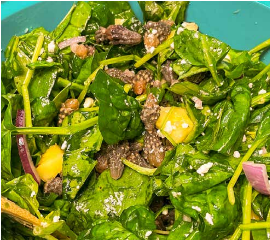
A finished spring salad with cholla buds that was prepared at the Sept. 10 Indigenous Foods Cooking Demo.

The Nutrition Coalition is planning more in-person cooking demos in the future. Their next cooking class will feature a prickly pear jamming class and baking classes later this Fall.