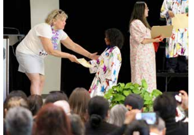
Students receive their certificate during a ceremony on May 23.