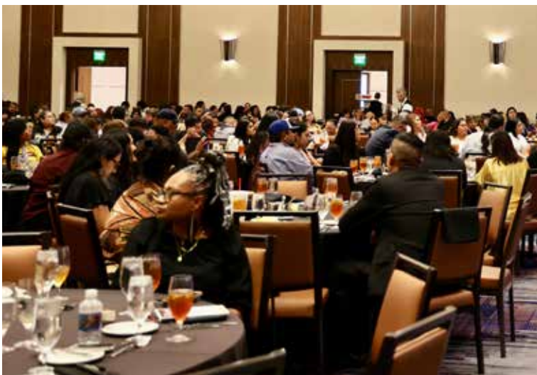
Students, family, and tribal leadership attend the 2024 Graduation Recognition Banquet on June 7.

Gila River Indian News P.O. Box 459 Sacaton, AZ 85147 Change Service Requested