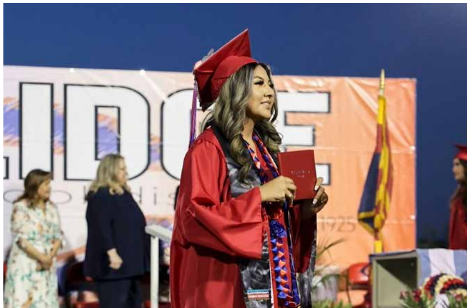
GRIC students receive their diploma during the Coolidge High School Graduation ceremony on May 22.