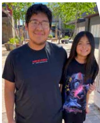
William James Higley High School