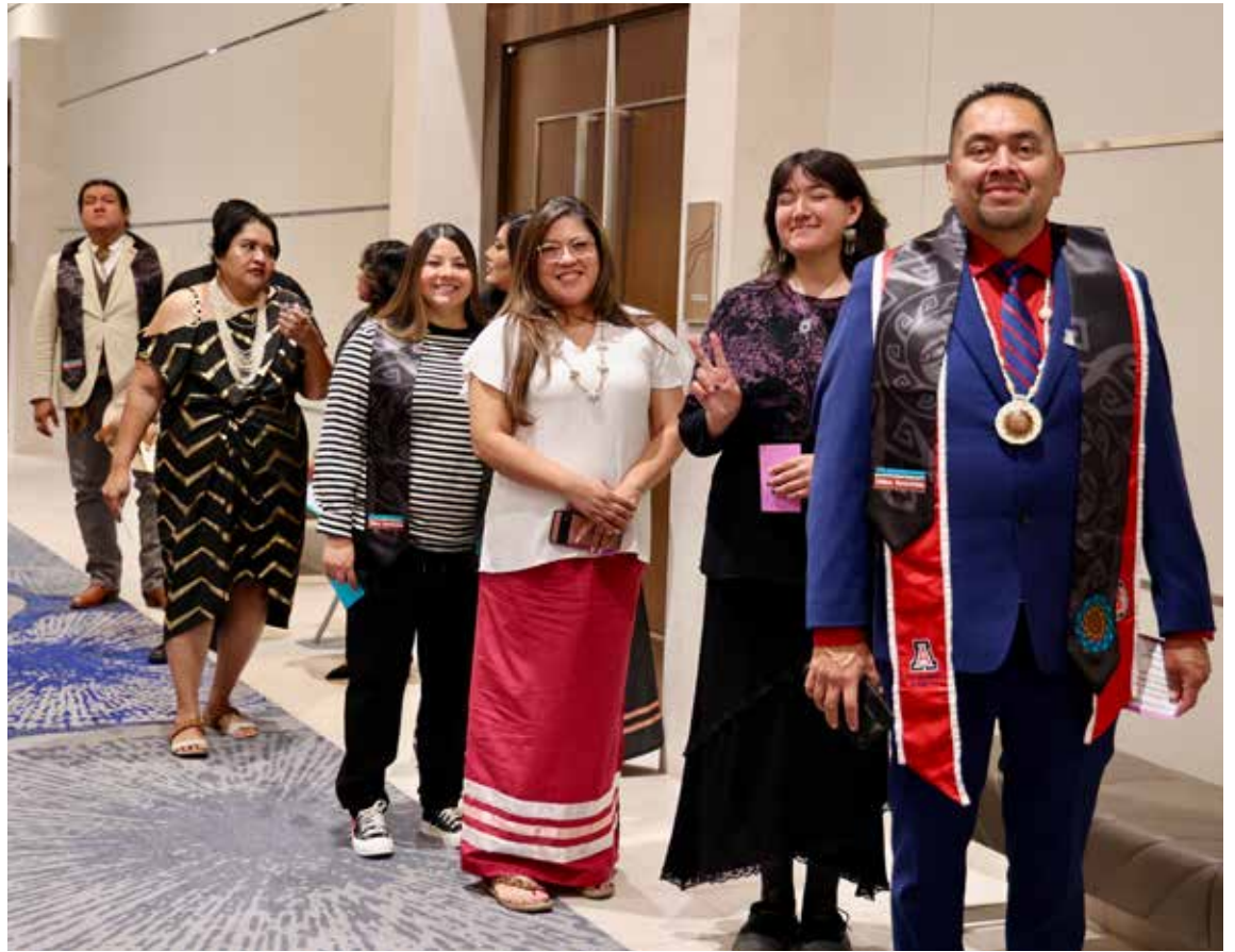
Students pose for a photo as they wait to cross the stage for their families, peers, and tribal leaders.