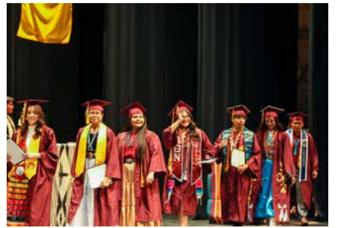
Students enter onto the stage welcomed in by their loved ones.