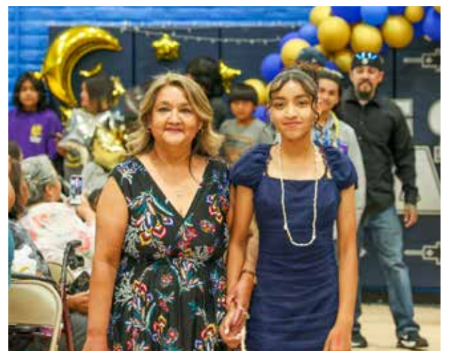
Students are escorted by family into the school's gymnasium.