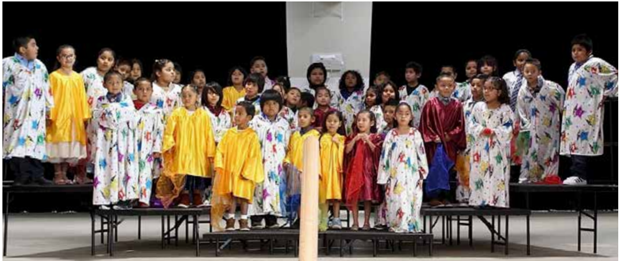
Gila Crossing Community School's Kindergarten class.

The families in attendance gathered outside the cafeteria to follow their students into the classroom and take pictures with them. All the families shared their congratulations with balloons and other gifts for the students who were being promoted. The event successfully highlighted the young students' achievements in school (GCCS).