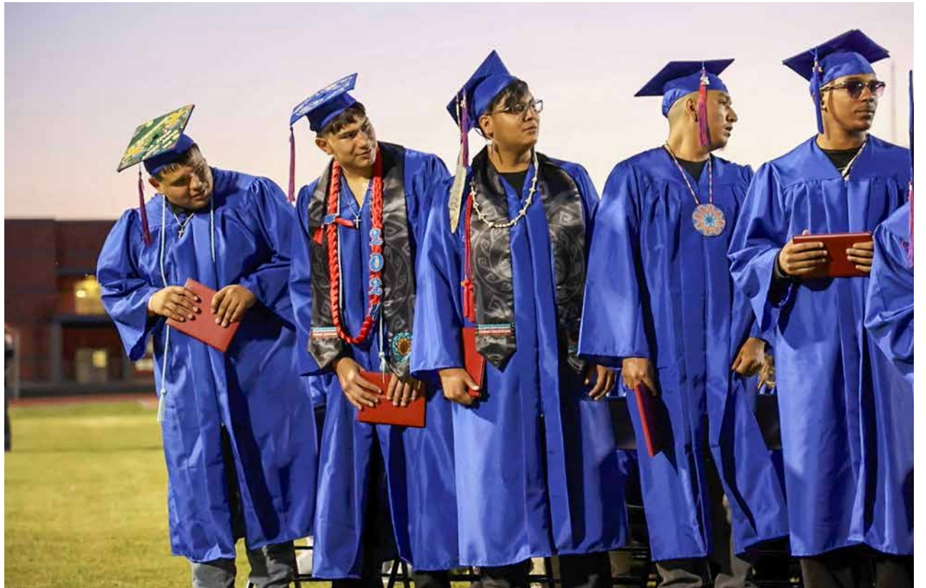
Coolidge High School Senior Class of 2024.

Fireworks would close the ceremony with students rushing to celebrate with each other and their families.