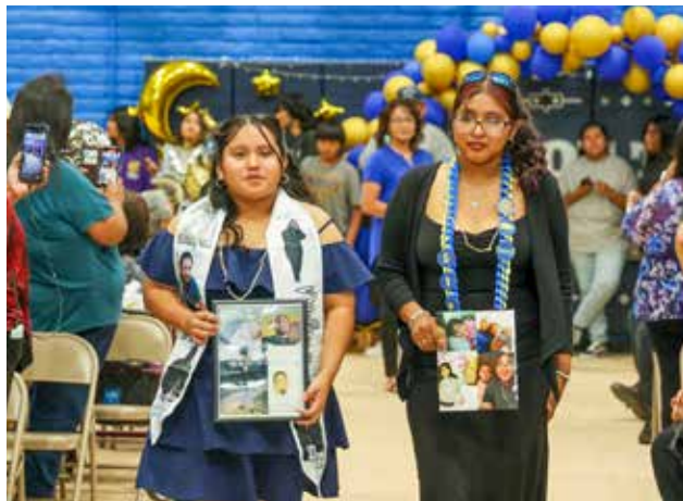
Students enter the school's gymnasium for the middle school promotion ceremony.