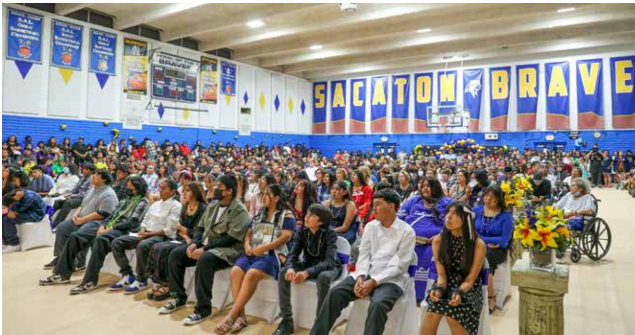
54 students are promoted from Sacaton Middle School during a ceremony on May 21.

Students were presented with their certificates of completion amidst cheers from their friends, families, and now former teachers. Tears from students and parents alike were seen on their faces, but not of sadness. The new high school students cried tears of joy as they walked to the class song, "Pursuit of Happiness" by Kid Cudi.