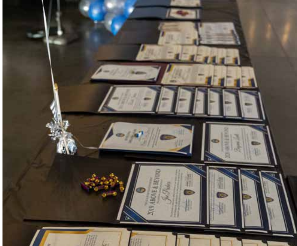
94 awards were presented at the Gila River Police Department’s Awards Banquet, honoring police officers through the years of 2019-2023.

The award banquet evening ended into the night with GRPD and their families congratulating one another for their accomplishments in public service.