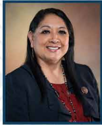
Lt. Governor Regina Antone