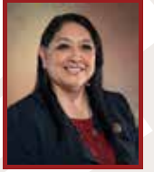
Regina Antone Lt. Governor