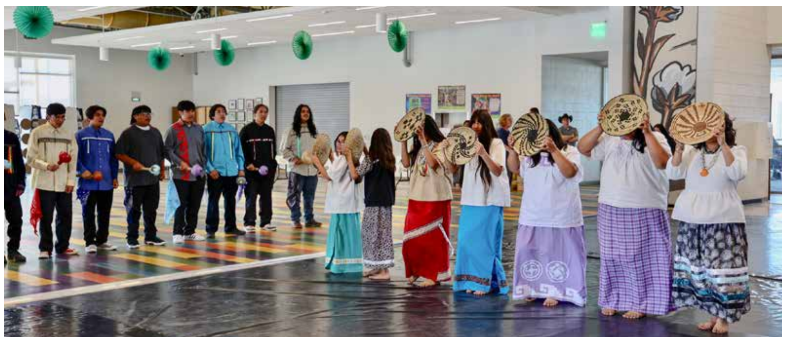
St. Peter Indian Mission School Basket Dancers and Gourd Singers close the Governor's education summit with traditional songs and dancing.