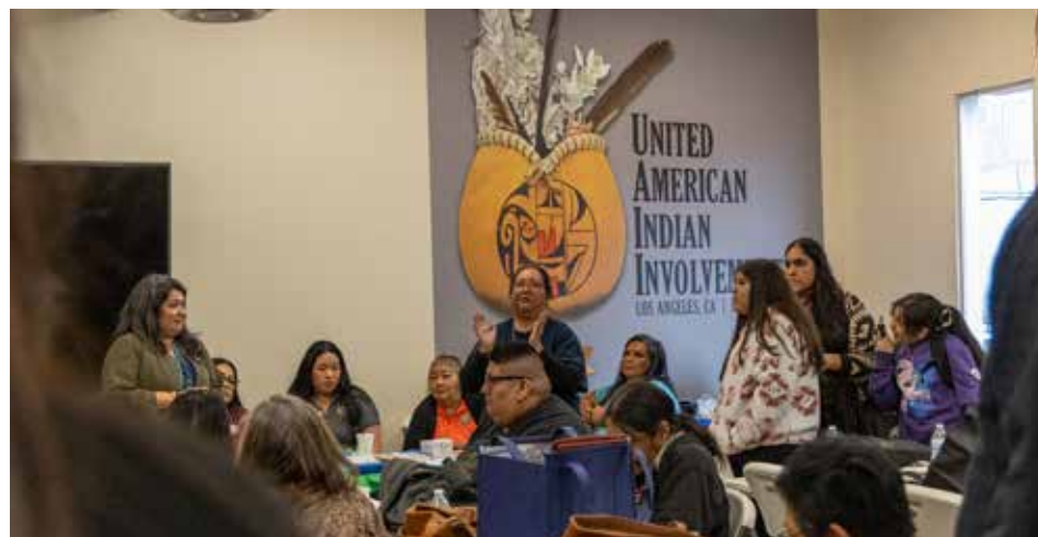
GRIC members in the Los Angeles area gather for services and information provided by GRIC departments at the United American Indian Involvement center.

"It's these types of events we want to continue