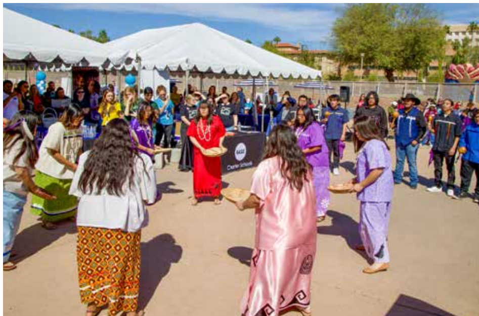
Skyline Gila River High School basket dancers and gourd singers perform at the 2024 'Charters at the Capitol' at the Wesley Bolin Plaza on Feb. 27.