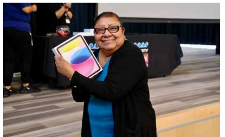
Community member wins an iPad as part of the raffle at the Education Summit.