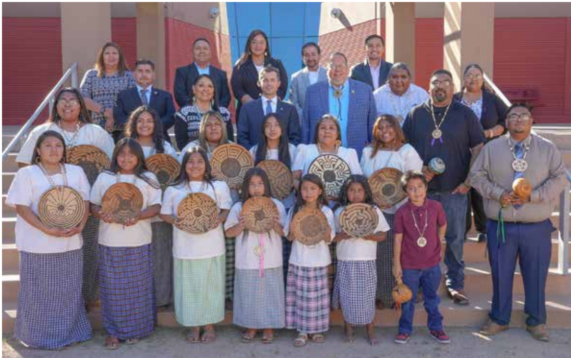
Tribal leaders, the Keli Akimel Hua Modk Cudkdam (Gila River Basket Dancers), and Department of Transportation Secretary Pete Buttigieg (center) at the Huhugam Heritage Center.

Secretary Buttigieg then held a tribal leader roundtable to