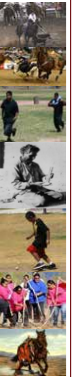
Clip Art

memories of the Mul-Chu-Tha over the years that made this article possible. Other sources related from the Gila River News Archives September 1964-